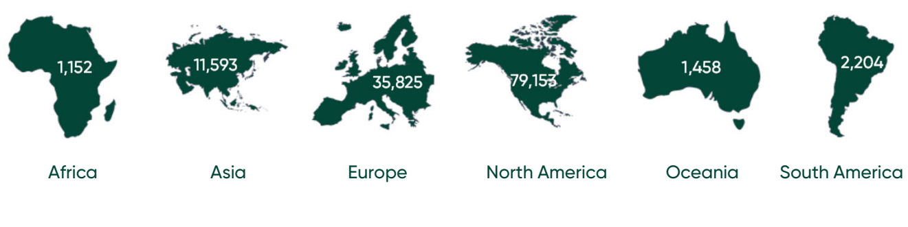
Exhibit 2: Proxy Votes by Region & ESG Category (Q3 2022 - Q2 2023)