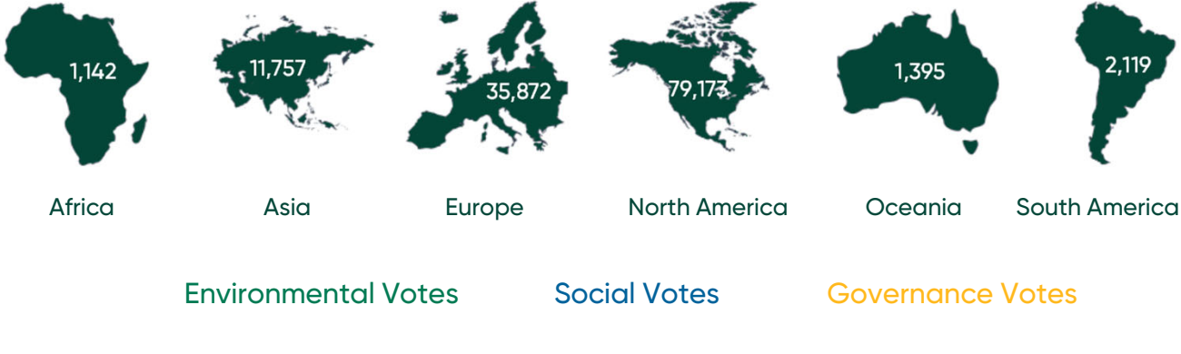
Exhibit 2: Proxy Votes by Region & ESG Category (Q4 2022 - Q3 2023)